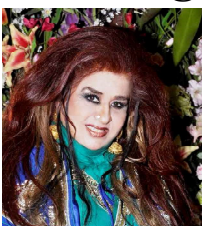
By: Shahnaz Husain

While there's a lot to love about this time of the year acne can really ruin your fun.